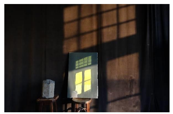
There where the light comes in