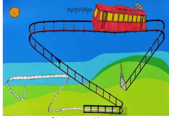
Stairway to Heaven