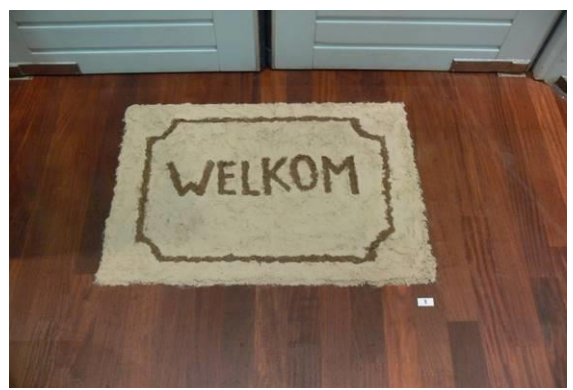
WELKOM Cityhall Almelo

Teachers at the art academy compared his way of working with that of the Fluxus movement.