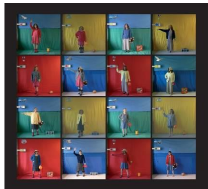
16 x 16