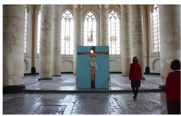
Procession Bergkerk Deventer