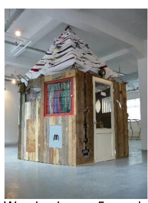
Wooden house 5 panels